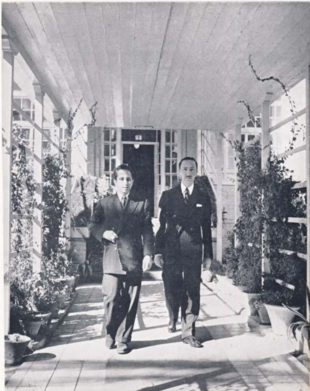
His Majesty King Faisal II and H.R.H. the Crown Prince in Baghdad.