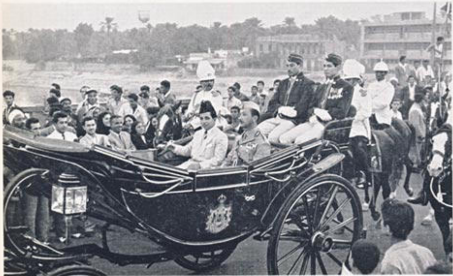
His Majesty on returning to his capital after completing his education at Harrow.

His ideals he has often expressed in addressing his people. “It is my duty” he once said, “to act for the whole community, that I may secure glory and prosperity for it. The monarch is the first servant of the community.”