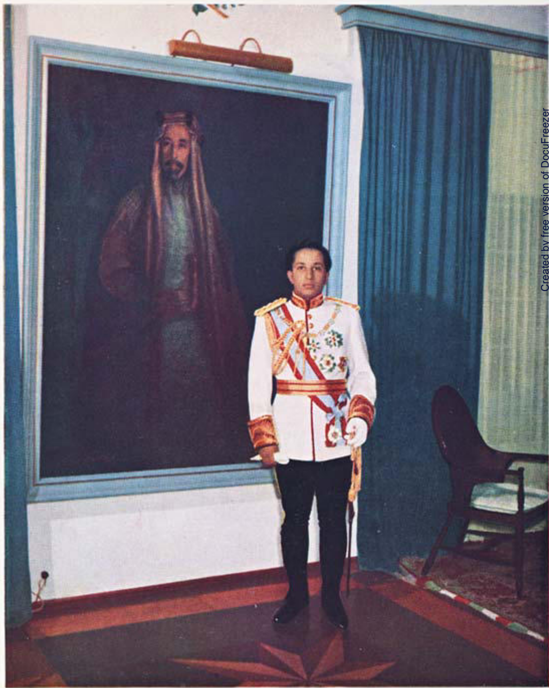
His Majesty King Faisal II of Iraq stands before a portrait of his Grandfather, His late Majesty King Faisal I.